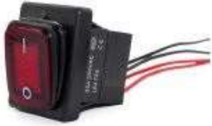
ON-OFF Rocker Switch